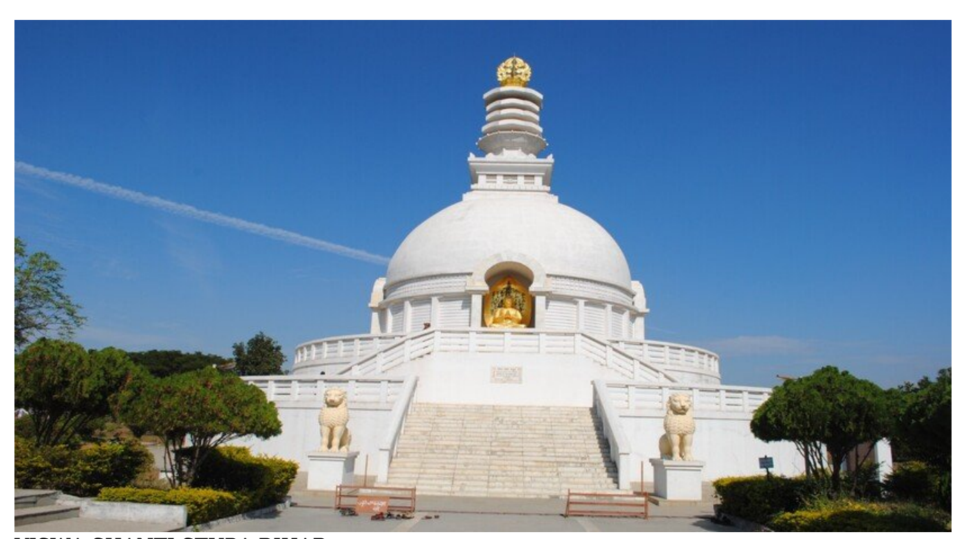
VISWA SHANTI STUPA BIHAR