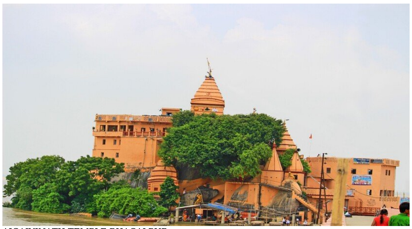
AJGAIVINATH TEMPLE BHAGALPUR