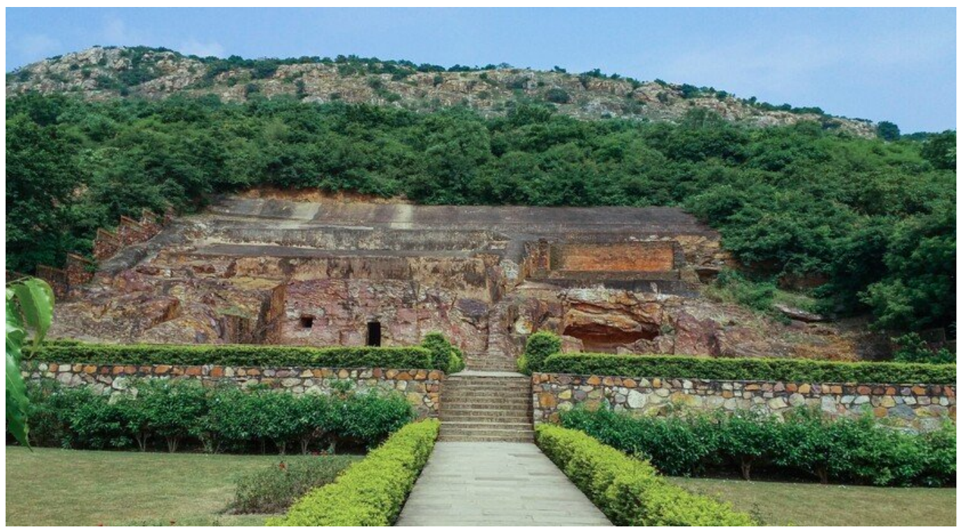
SONABHANDAR CAVES RAJGIR