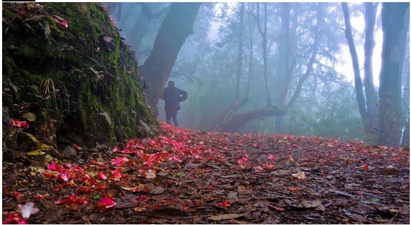
BARSEY RHODODENDRON SANCTUARY