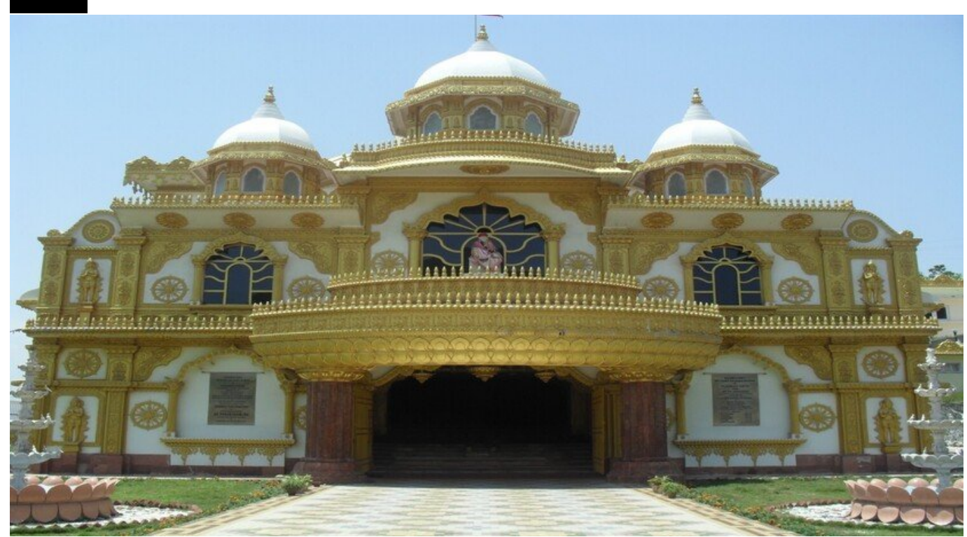
SIRDI SAI MANDIR