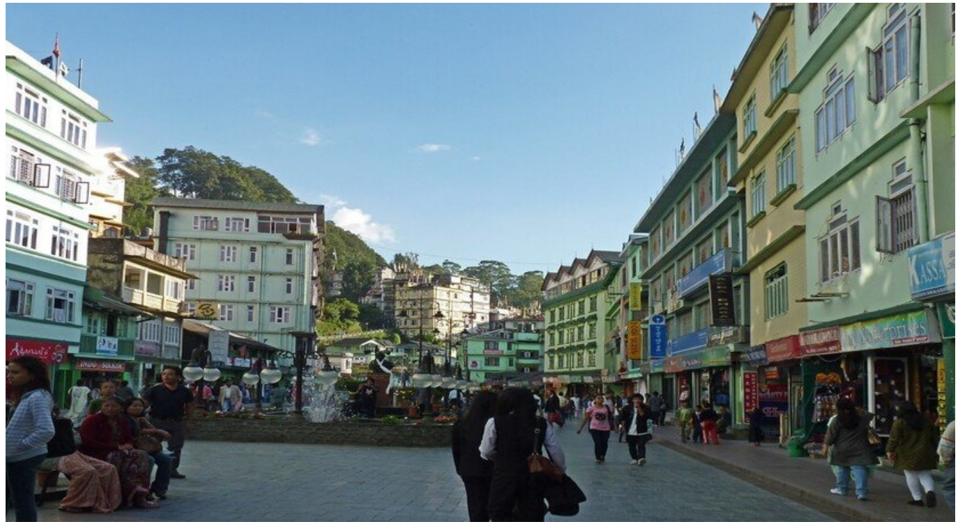
MG MARG GANGTOK