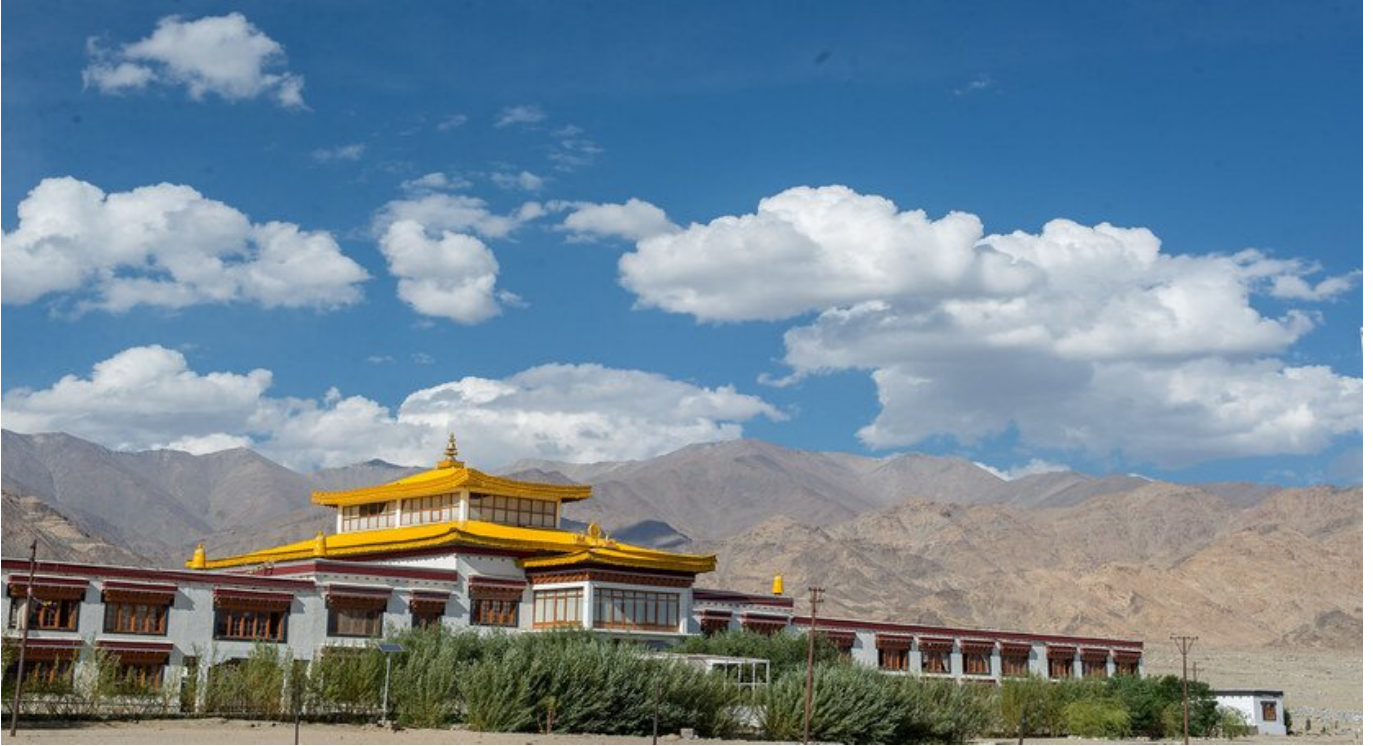
DRUK WHITE LOTUS SCHOOL