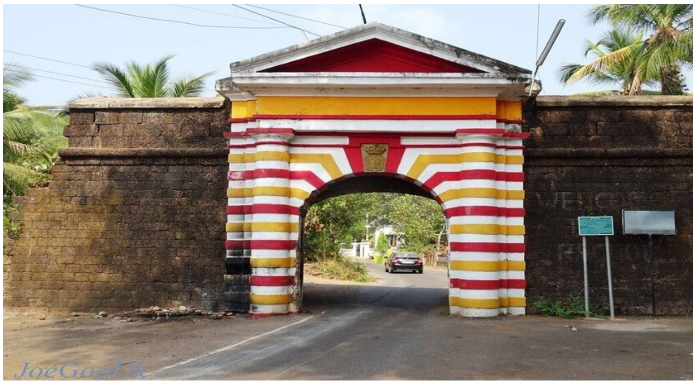
RACHOL FORT GOA