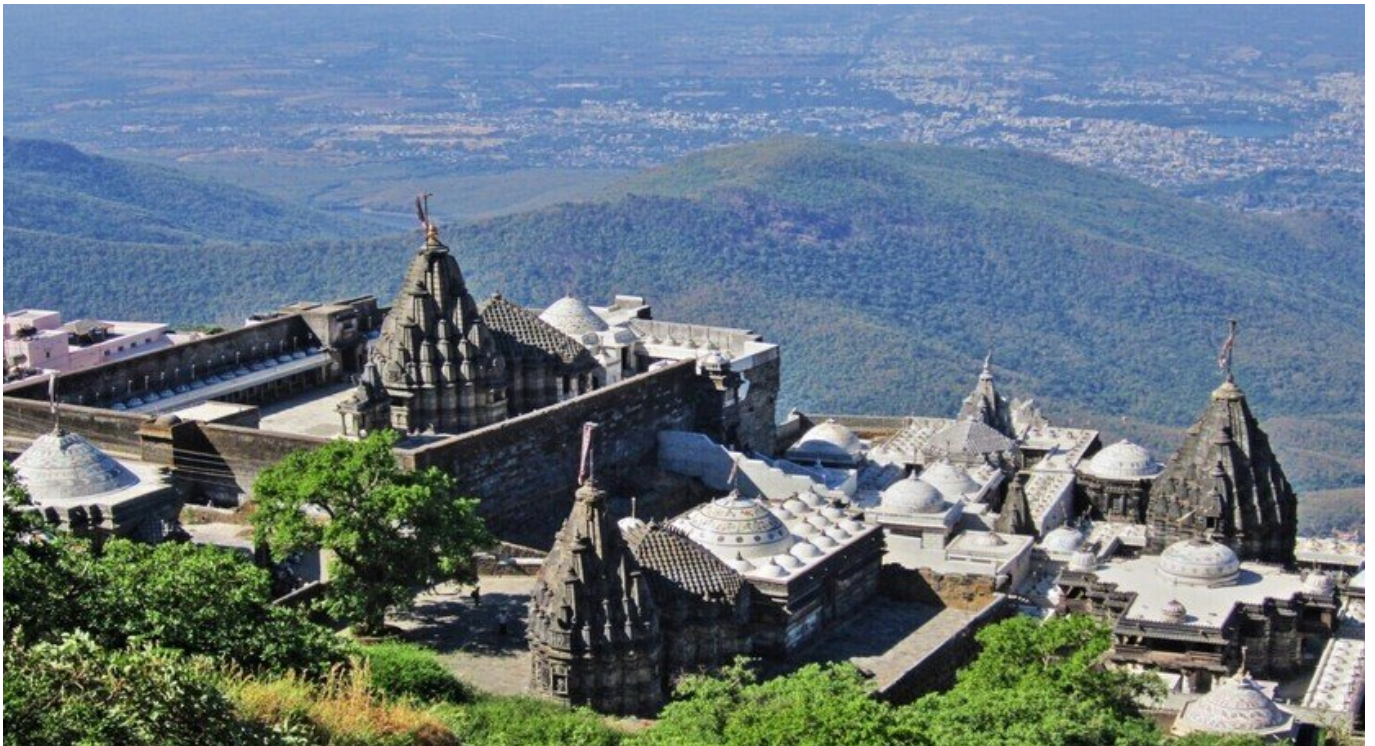
JAIN TEMPLE GIRNAR