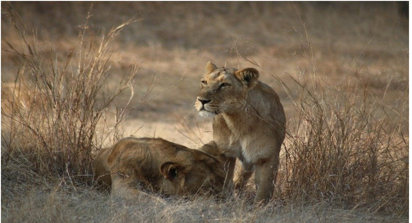
Gir Wildlife Lions India Asiatic Lion