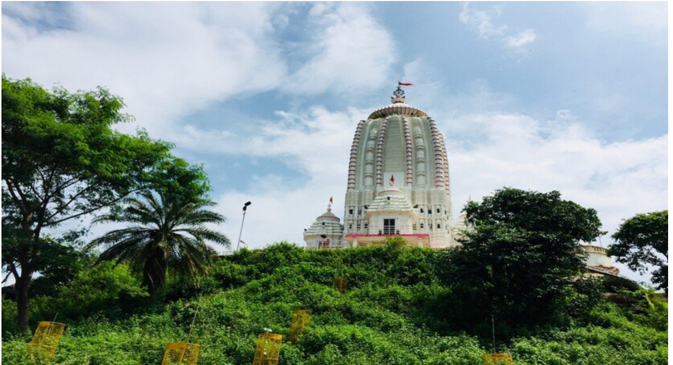
JAGANNATH TEMPLE RANCHI