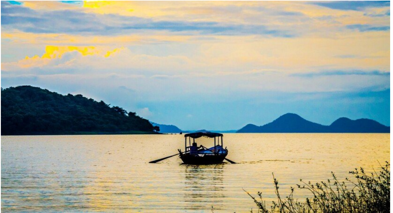
MAITHON DAM DHANBAD