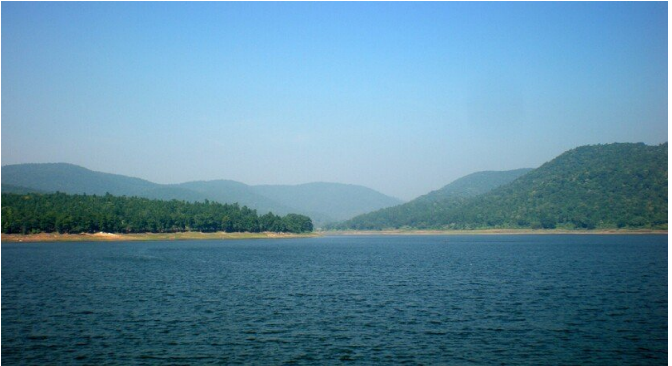
BURUDI LAKE GHATSHILA