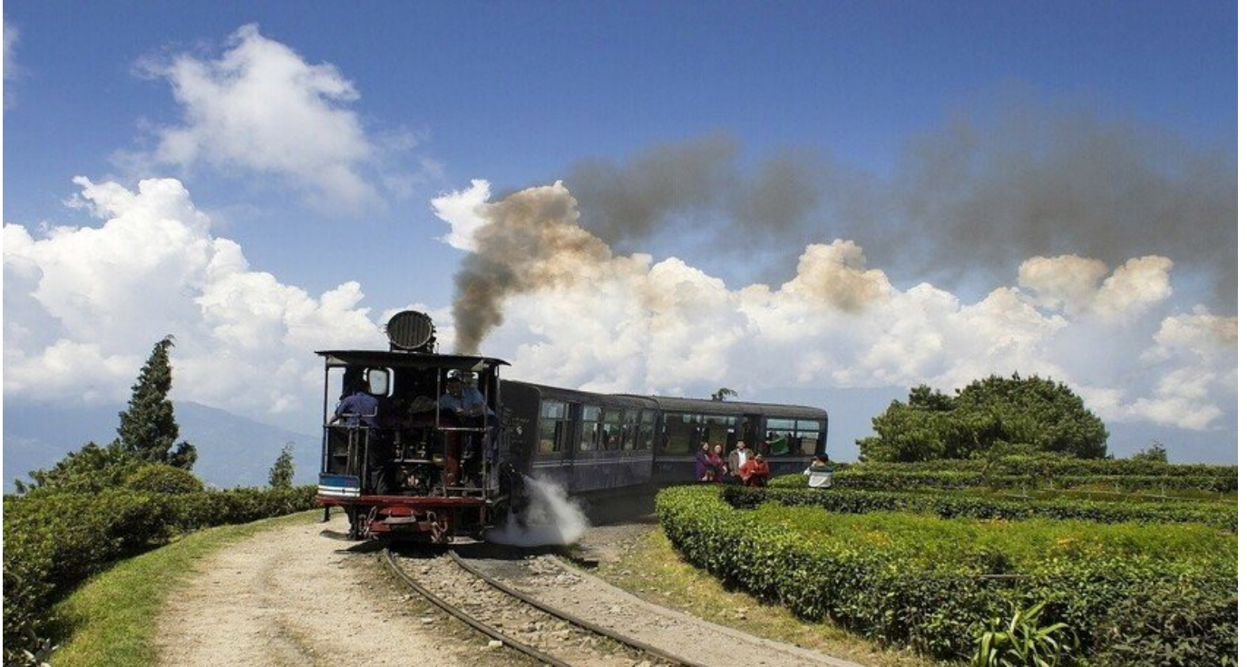
DARJEELING TOY TRAIN