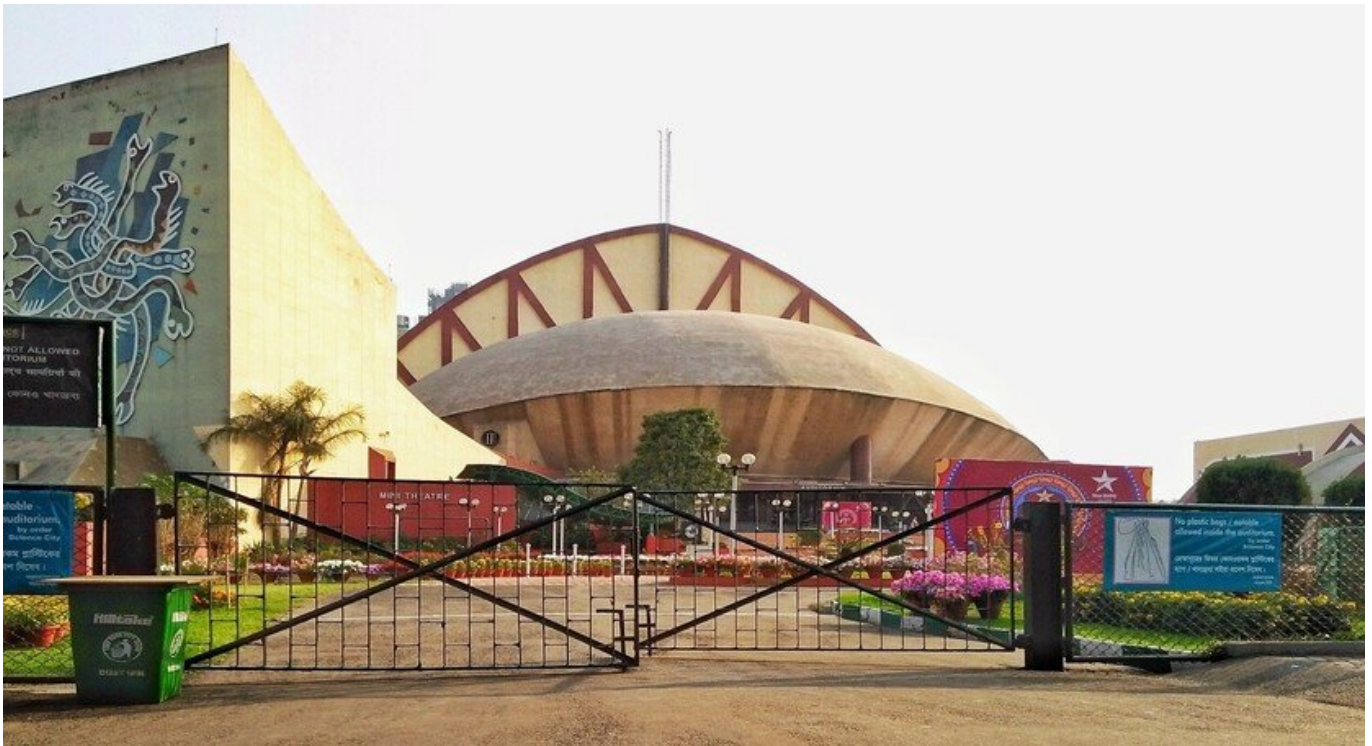
SCIENCE CITY KOLKATA