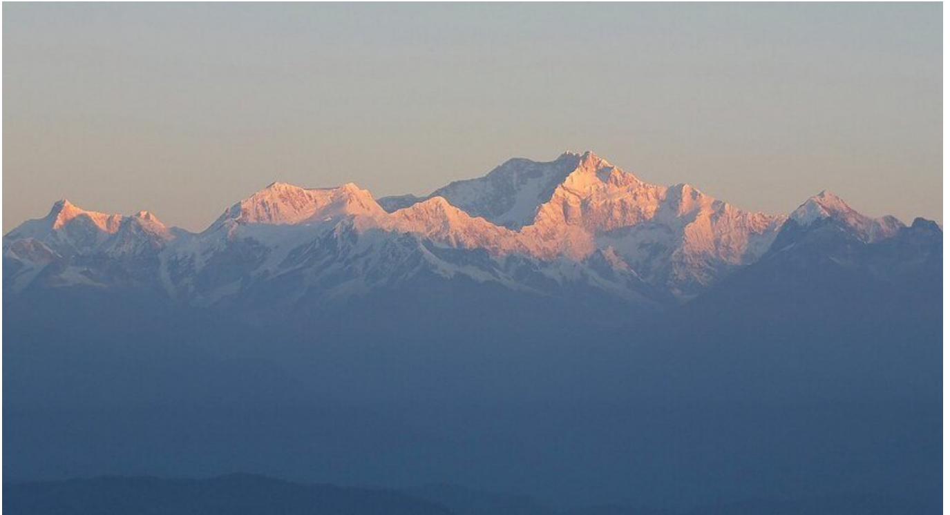
TIGER HILL DARJEELING