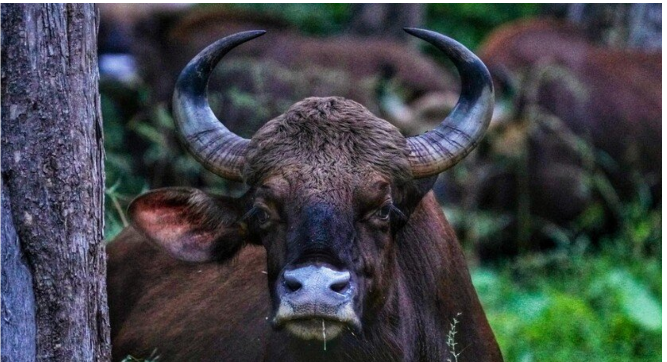
GORUMARA NATIONAL PARK DOOARS