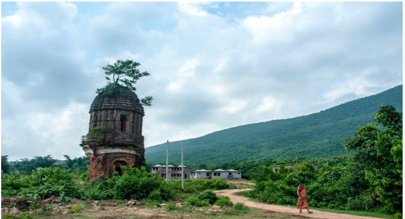
GAR PANCHKOT PURULIA